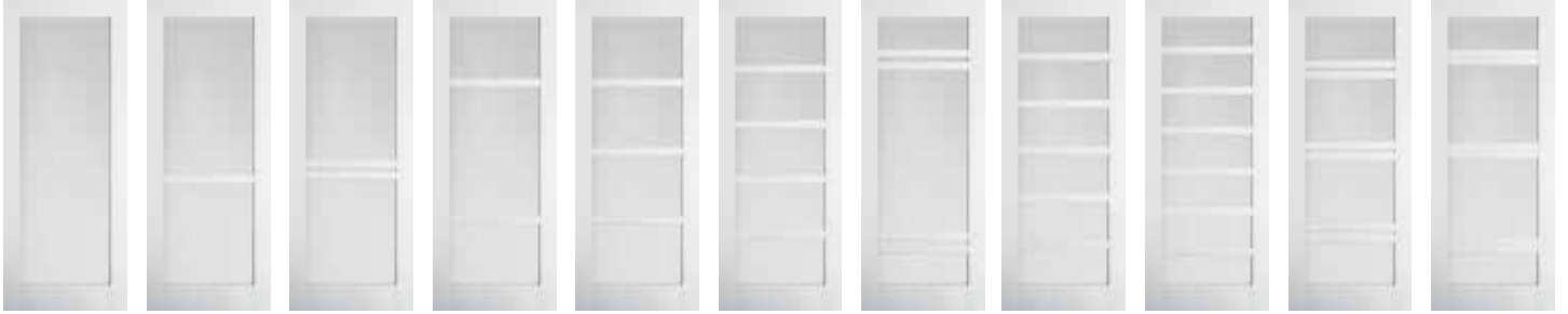
Moda 1 Moda 2 Moda 3 Moda 4 Moda 5 Moda 6 Moda 7 Moda 8 Moda 9 Moda 10 Moda 11