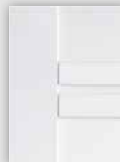
Square fitting rails