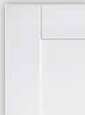
Stile and rail

Moda is factory primed for a smooth minimalist aesthetic that can't be overlooked. Its boldness lies in its simplicity.