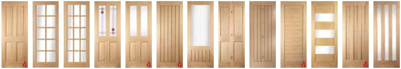
4 Panel 10 Light Clear 15 Light Clear 2 Light Mackintosh 2 Light Clear Cottage Cottage Etch 4 Panel Bi-Fold Cottage Bi-Fold Cottage Horizontal Cottage 3 Light Clear Horizontal Aston 3 Panel Aston 3 Light Clear/ Obscure